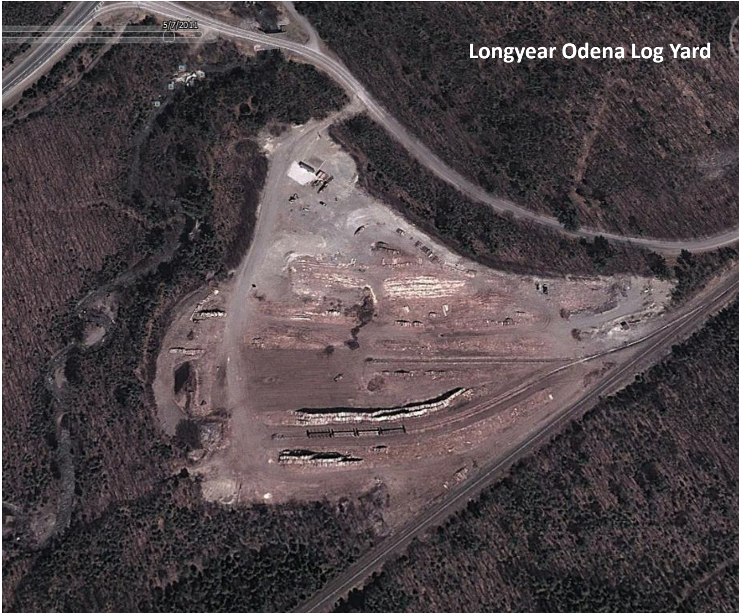
Longyear Odena Log Yard