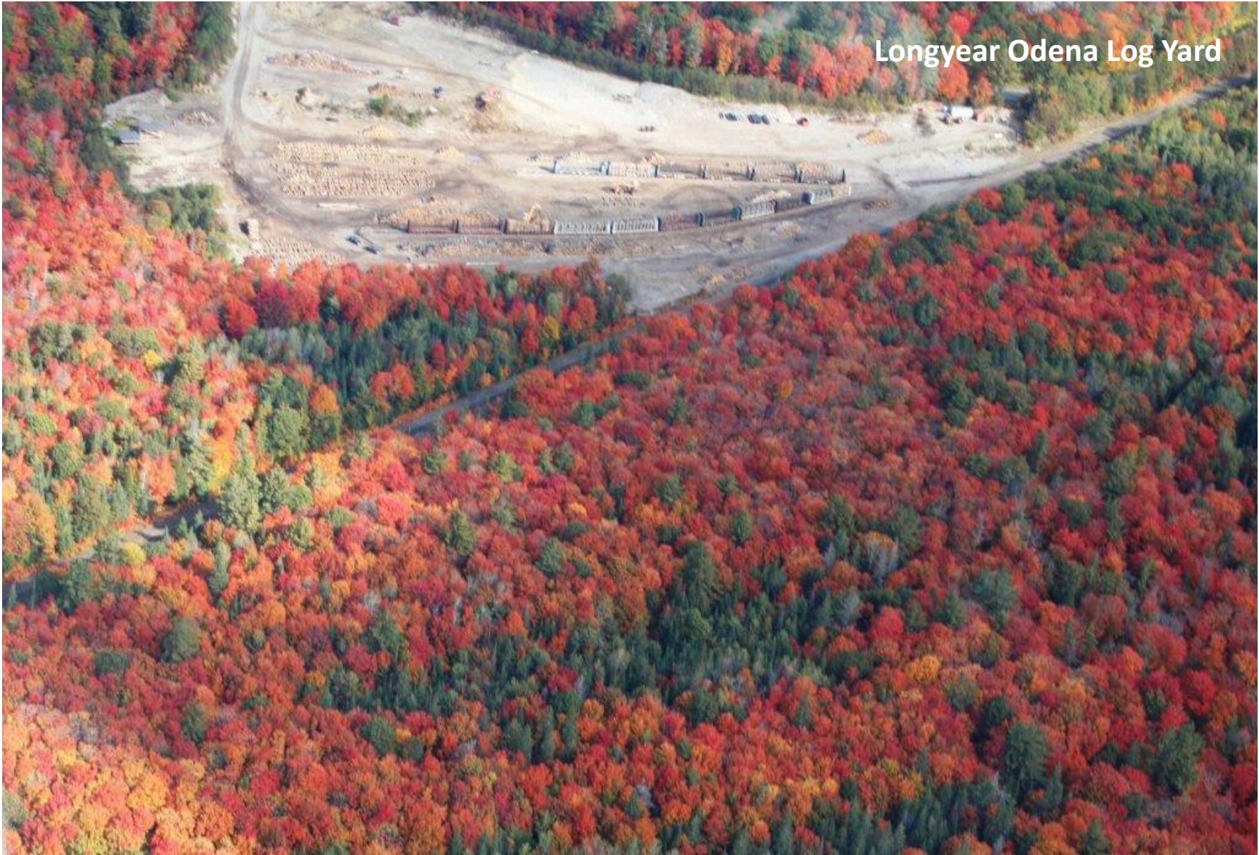
Longyear Odena Log Yard